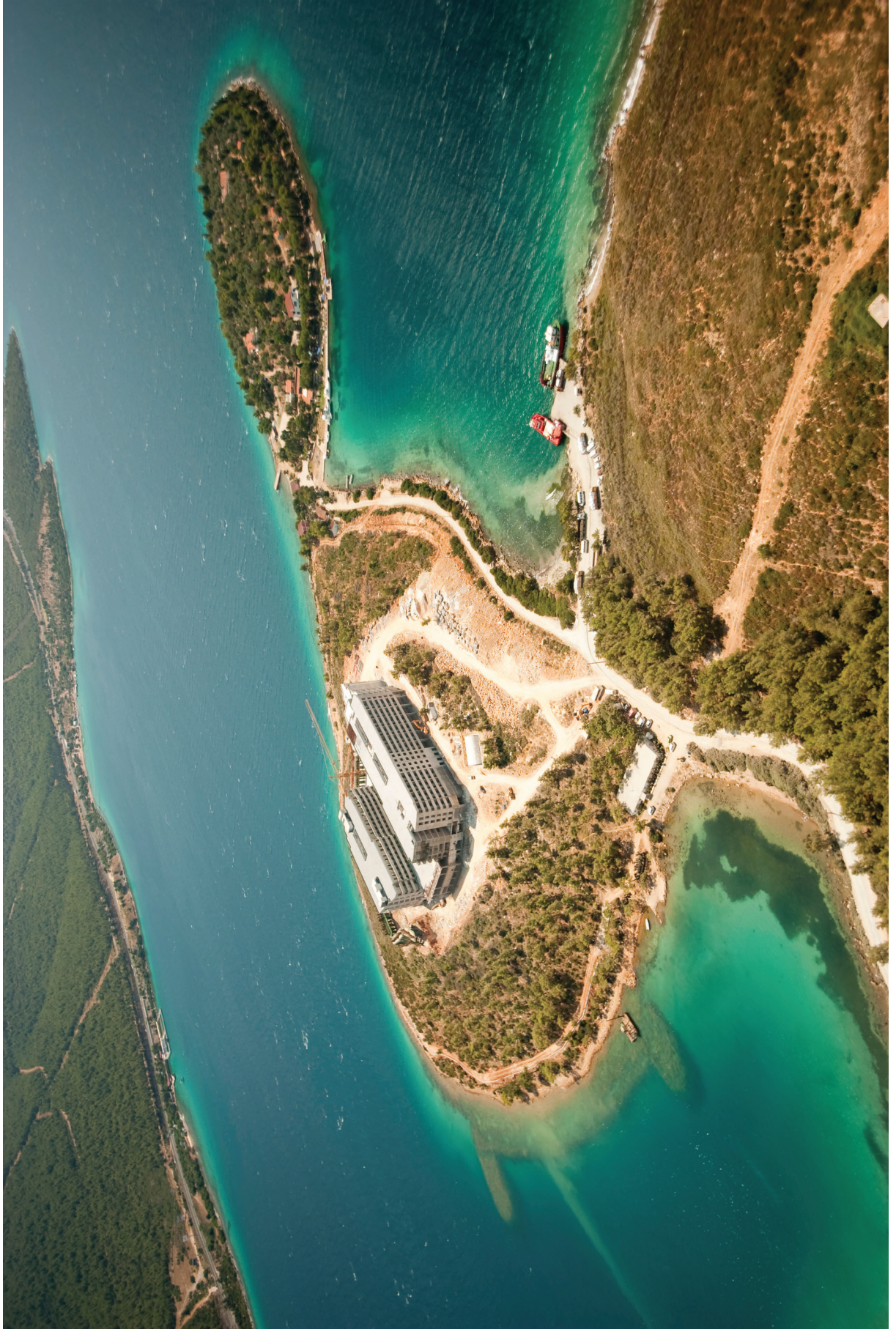
Fig. 7.1 for Question 7 Hotel construction in Turkey, an MIC in Eurasia